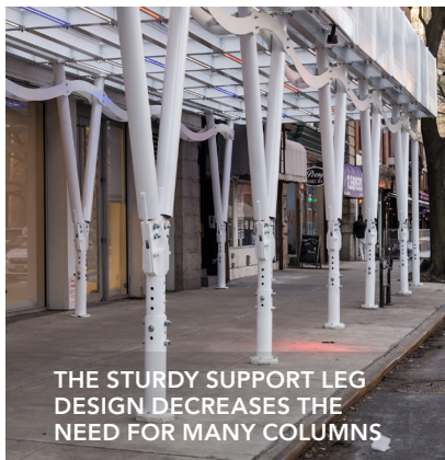
THE STURDY SUPPORT LEG DESIGN DECREASES THE NEED FOR MANY COLUMNS