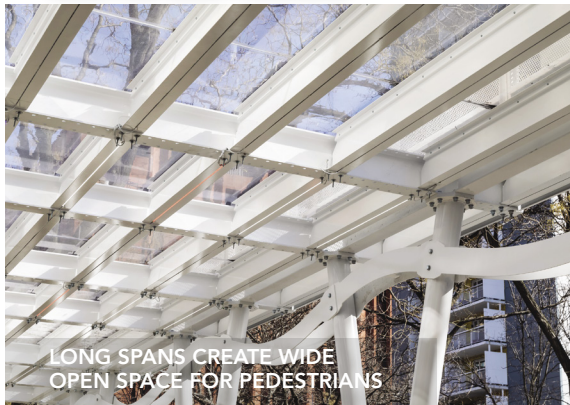
LONG SPANS CREATE WIDE OPEN SPACE FOR PEDESTRIANS

The community at large benefits from an appealing contemporary look that preserves the integrity of their neighborhood and business environment while keeping the public safe from falling debris.