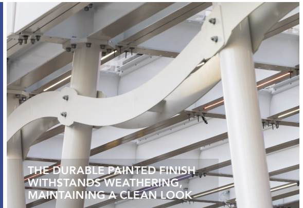
THE DURABLE PAINTED FINISH WITHSTANDS WEATHERING, MAINTAINING A CLEAN LOOK

The community at large benefits from an appealing contemporary look that preserves the integrity of their neighborhood and business environment while keeping the public safe from falling debris.