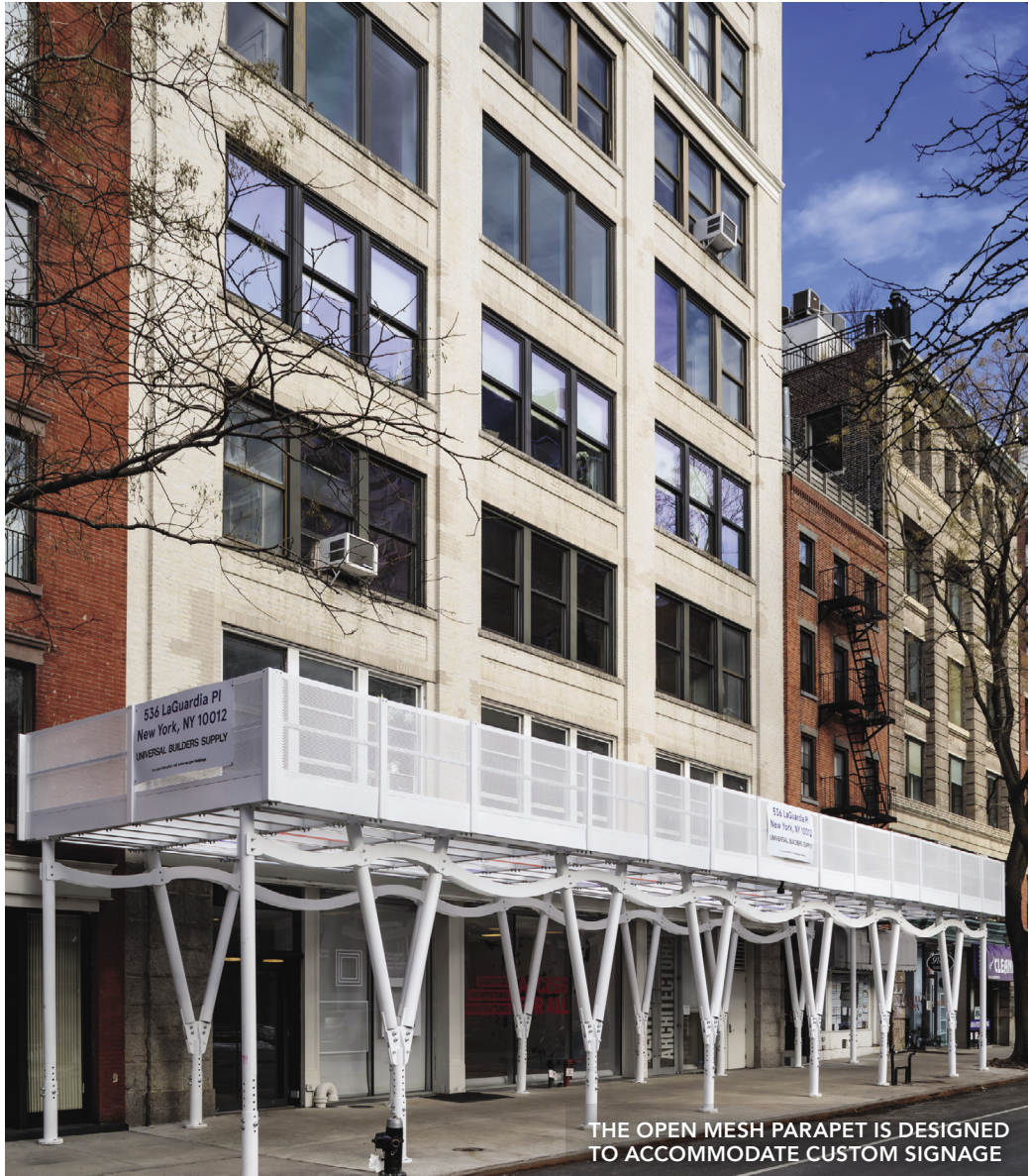
THE OPEN MESH PARAPET IS DESIGNED TO ACCOMMODATE CUSTOM SIGNAGE