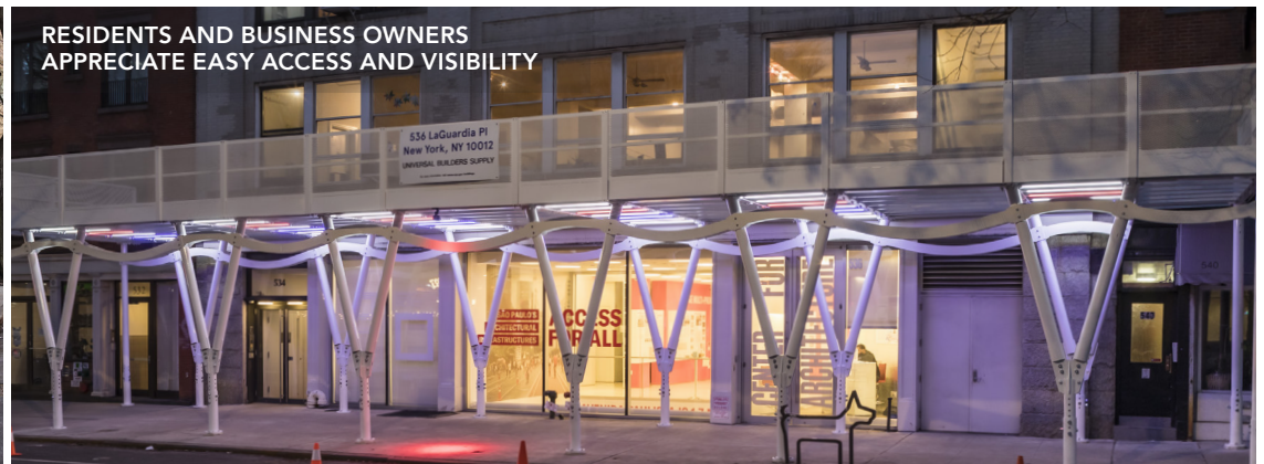
RESIDENTS AND BUSINESS OWNERS APPRECIATE EASY ACCESS AND VISIBILITY